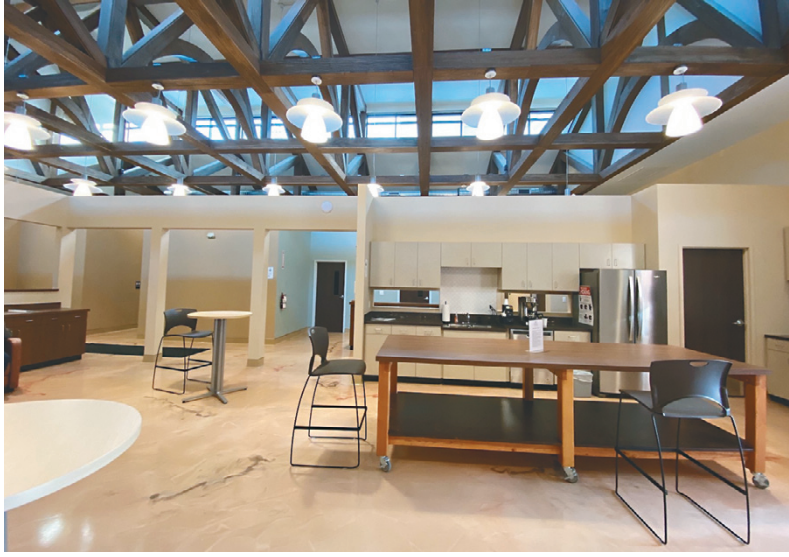
Daybreak at Heart, Love & Soul

"With the opening of Daybreak, Niagara Falls residents will have better access to the services they need to address the challenges of poverty and social injustice. The